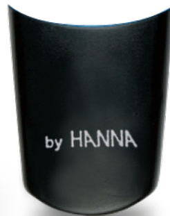
Removable safety cap