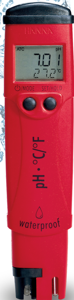
Illustration shows High Range Tester HI 98128

Exposed temperature sensor provides fast response time