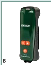
A. Articulating (6mm diameter) camera tip adjusts up to 240° viewing angle with four built-in bright LED lights illuminate dark areas B. HDV-WTX — Optional Wireless Transmitter transmits video to the main display from tight or hard to reach places up to 100ft (30m) away