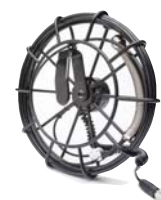
Camera probes with cable length greater than 3m will be coiled on a spool as shown on the left.