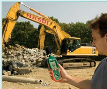
Meets new IEC 61672-1 Class 2 accuracy standard for OSHA and other local and national noise ordinances