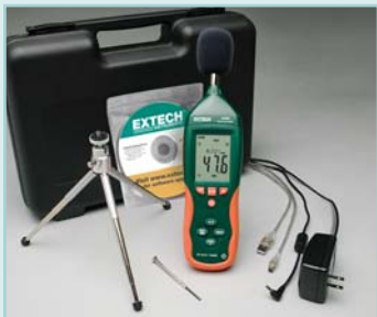
Meter and accessories are packaged in a rugged hard carrying case for added protection