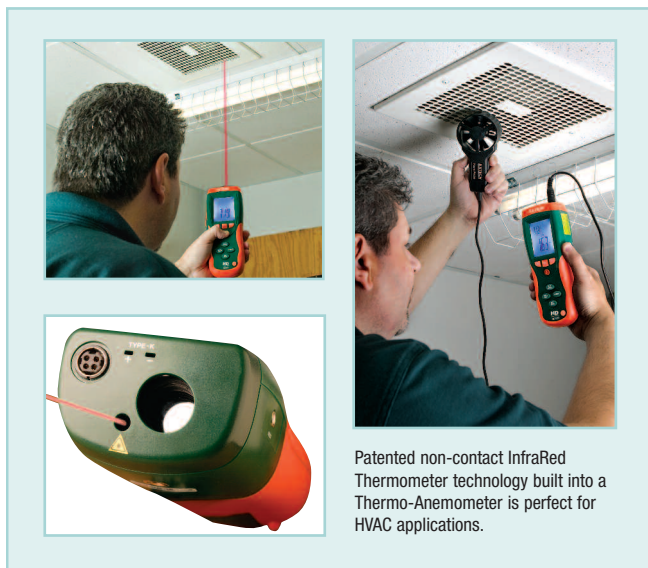
Patented non-contact InfraRed Thermometer technology built into a Thermo-Anemometer is perfect for HVAC applications.