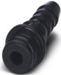
Pneumatic pin, for HC-M-PN3 module, internal hose diameter of 4.0 mm

Please be informed that the data shown in this PDF Document is generated from our Online Catalog. Please find the complete data in the user's documentation. Our General Terms of Use for Downloads are valid ( http://phoenixcontact.com/download )