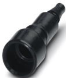
Pneumatic socket, for HC-M-PN3 module, internal hose diameter of 3.0 mm

Please be informed that the data shown in this PDF Document is generated from our Online Catalog. Please find the complete data in the user's documentation. Our General Terms of Use for Downloads are valid ( http://phoenixcontact.com/download )