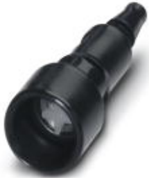
Pneumatic socket with valve, for HC-M-PN3 module, internal hose diameter of 3.0 mm

Please be informed that the data shown in this PDF Document is generated from our Online Catalog. Please find the complete data in the user's documentation. Our General Terms of Use for Downloads are valid ( http://phoenixcontact.com/download )