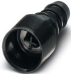
Pneumatic socket with valve, for HC-M-PN2 module, internal hose diameter of 6.0 mm

Please be informed that the data shown in this PDF Document is generated from our Online Catalog. Please find the complete data in the user's documentation. Our General Terms of Use for Downloads are valid ( http://phoenixcontact.com/download )