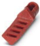
Coding profile for HC-MOD-K... housing