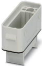
HEAVYCON plastic panel mounting base, for modules for one module slot, without PE marking, for snap locking

Please be informed that the data shown in this PDF Document is generated from our Online Catalog. Please find the complete data in the user's documentation. Our General Terms of Use for Downloads are valid ( http://phoenixcontact.com/download )