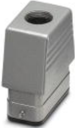
HEAVYCON sleeve housing, D15, for single locking latch, height: 66 mm, without 1 x M20 support, straight cable outlet

Please be informed that the data shown in this PDF Document is generated from our Online Catalog. Please find the complete data in the user's documentation. Our General Terms of Use for Downloads are valid ( http://phoenixcontact.com/download )