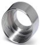
Step-up adapter, M20 to M25, including O-ring

Extension adapter - ENLAR-M-KV-M20/M25 - 1647666