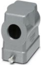
HEAVYCON B10 sleeve housing, for single locking latch, height: 72 mm, with 1 x M32 thread, lateral cable outlet

Please be informed that the data shown in this PDF Document is generated from our Online Catalog. Please find the complete data in the user's documentation. Our General Terms of Use for Downloads are valid ( http://phoenixcontact.com/download )