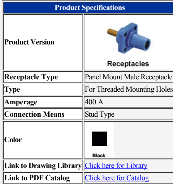
Male Receptacle, Threaded