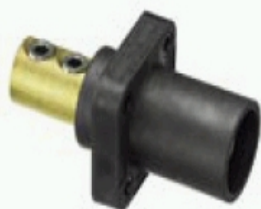
400 Amp Set Screw Type Panel Mount Female Receptacle, Black