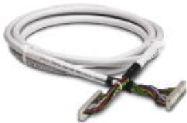
The illustration shows version FLK 40/EZ-DR/200/SLC

Round cable sets, with 40-pos. socket strips in fixed lengths (50 cm steps) to connect to 32-channel I/O cards of the SLC 500, length 1 m