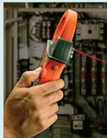
Built-in IR Thermometer with laser pointer is an excellent troubleshooter for locating hot spots and overheating motors.