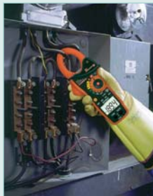
CAT IV -600V safety rating for added protection and True RMS feature gives you accurate readings of non-sinusoidal waveforms.