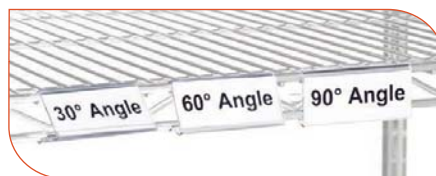
LHA3C Bottom Shelf View