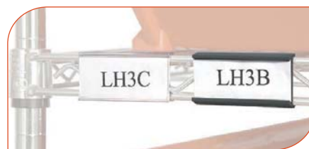
LHA3C Top Shelf View