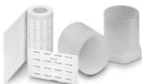
The figure shows the EML (20X8)R product variant

Label, Roll, white, unlabeled, can be labeled with: THERMOMARK ROLL, THERMOMARK ROLL X1, THERMOMARK X, THERMOMARK S1.1, Mounting type: Adhesive, Lettering field: 70 x 50 mm