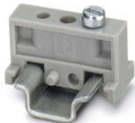
End clamp, width: 6.2 mm, color: gray

Please be informed that the data shown in this PDF Document is generated from our Online Catalog. Please find the complete data in the user's documentation. Our General Terms of Use for Downloads are valid ( http://phoenixcontact.com/download )