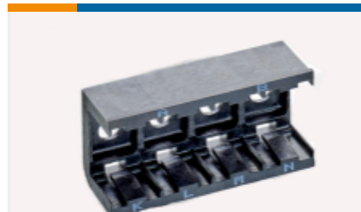
TE Part #DCR-1A-06 COMPOSIT RAIL