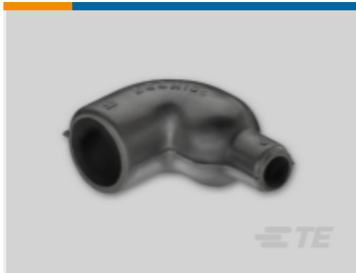
TE Part #806823-000 Bulbous Heat Shrink Boots: Lipped, Right Angle