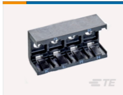
TE Part #DCR-1A-06 COMPOSIT RAIL