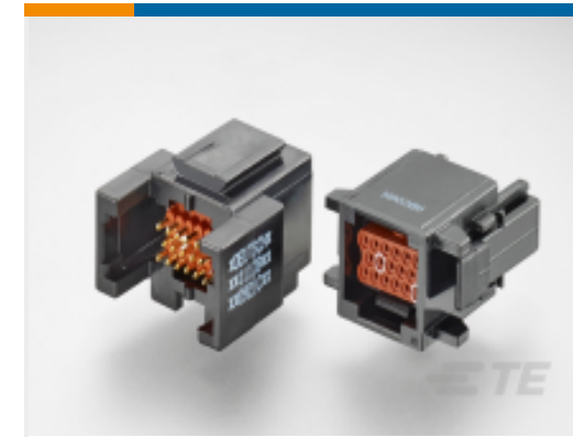
TE Part #ABC06N-22P IN-LINE PLUG