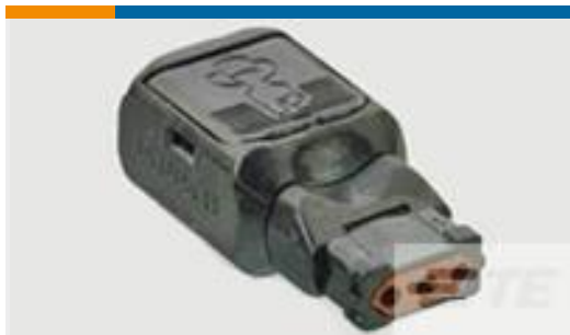
TE Part #D369-P33-NS1 369 3 WAY PLUG, CRIMP, SKT