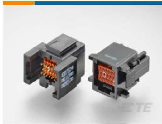
TE Part #ABC03N-20P IN-LINE RECP