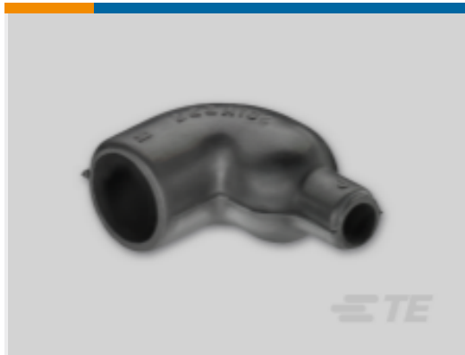
TE Part #806823-000 Bulbous Heat Shrink Boots: Lipped, Right Angle