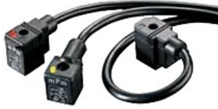
Series image - Reference only

Status: Active Series: 121040 Category: Molex Parts Engineering/Old PN: E432N2N10012