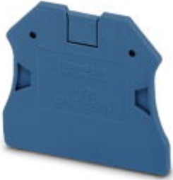
End cover, Length: 48 mm, Width: 2.2 mm, Height: 48.4 mm, Color: blue

Please be informed that the data shown in this PDF Document is generated from our Online Catalog. Please find the complete data in the user's documentation. Our General Terms of Use for Downloads are valid ( http://phoenixcontact.com/download )