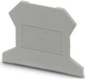
End cover, length: 42.5 mm, width: 1.5 mm, height: 30.7 mm, color: gray

Please be informed that the data shown in this PDF Document is generated from our Online Catalog. Please find the complete data in the user's documentation. Our General Terms of Use for Downloads are valid ( http://phoenixcontact.com/download )