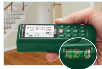
Built-in Bubble-Level for reference