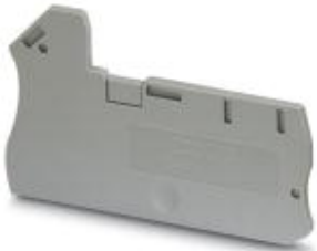
End cover, Length: 68 mm, Width: 2.2 mm, Color: gray

Please be informed that the data shown in this PDF Document is generated from our Online Catalog. Please find the complete data in the user's documentation. Our General Terms of Use for Downloads are valid ( http://phoenixcontact.com/download )