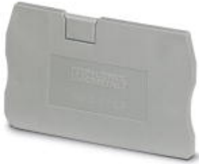
End cover, Length: 48.6 mm, Width: 2.2 mm, Height: 29.1 mm, Color: gray

Please be informed that the data shown in this PDF Document is generated from our Online Catalog. Please find the complete data in the user's documentation. Our General Terms of Use for Downloads are valid ( http://phoenixcontact.com/download )