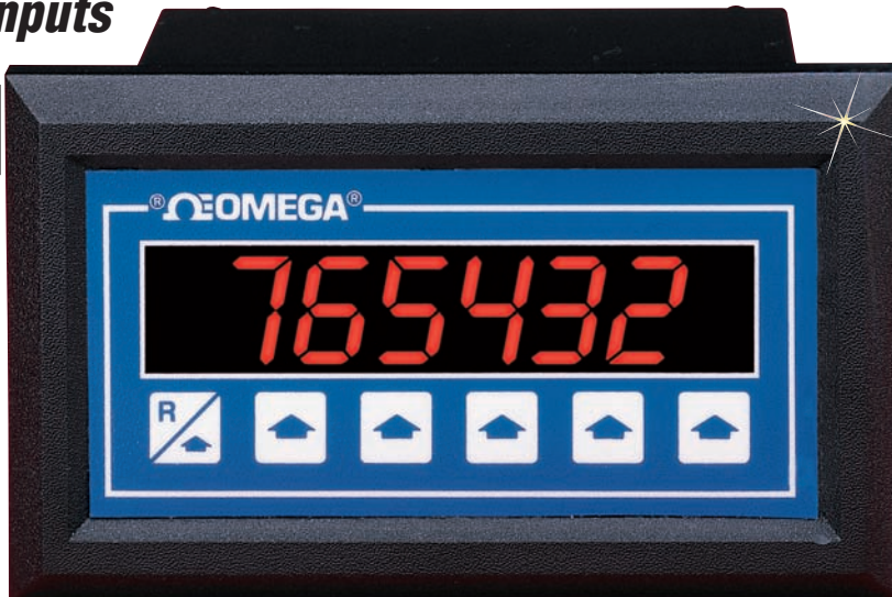
DPF66 1/8 DIN, shown actual size.

The DPF60 is a combination microprocessor-based digital rate indicator and integrating totalizer. It accepts inputs of 4 to 20 mA, 0 to 20 mA, 0 to 5 V, or 1 to 5 V and can be scaled for engineering units directly from the NEMA 4X (IP66) rated front panel without tweaking internal potentiometers. The dual standard 5 A (@ 250 Vac) relays can be assigned to the ratemeter, or to the totalizer, or one relay to each for batch control and rate alarm.