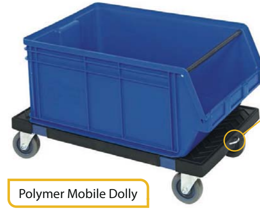
DLY-3018 Dolly with Padded Rubber Trim available in Blue. 1,000 lb. capacity. Dimensions 30"L x 18"W