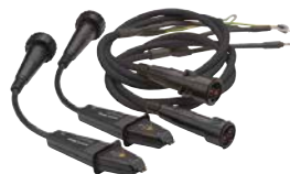
+ DH4-C probe 1.5 m leads