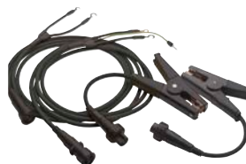
+ KC1 Kelvin clip 3 m leads