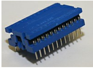
Item # CWR-130-16-0000, DIP Connectors