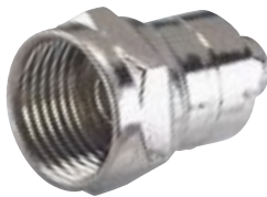
ITEM # CFC-7110 DESCRIPTION F MALE FOR RG-59 W/ 1/4" ATTACHED RING