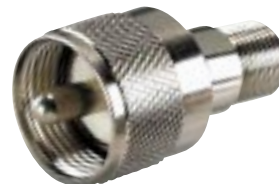
ITEM # CAD-1036 DESCRIPTION F FEMALE TO UHF MALE ADAPTER