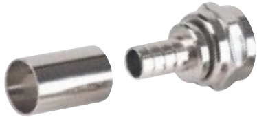
ITEM # CFC-7113 DESCRIPTION 2PC, F MALE FOR RG-59 W/ 1/2" RING