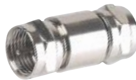
ITEM # CFS-0184 DESCRIPTION F MALE TO MALE COUPLER