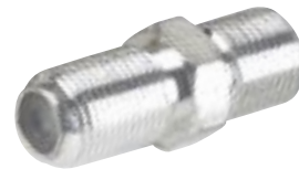
ITEM # CFS-1003 DESCRIPTION F-FEMALE TO FEMALE LONG VERSION COUPLER