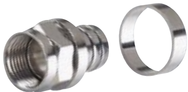
ITEM # CFC-7120 DESCRIPTION F MALE FOR RG-11 PVC W/SEPARATE RING