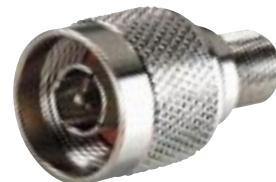
ITEM # CAD-1037 DESCRIPTION F FEMALE TO N MALE ADAPTER