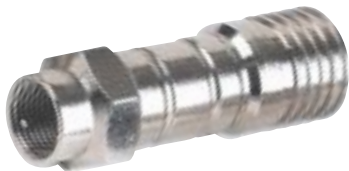
ITEM # CFC-7119 DESCRIPTION F.MALE FOR RG-11 PVC -1PC CONSTRUCTION