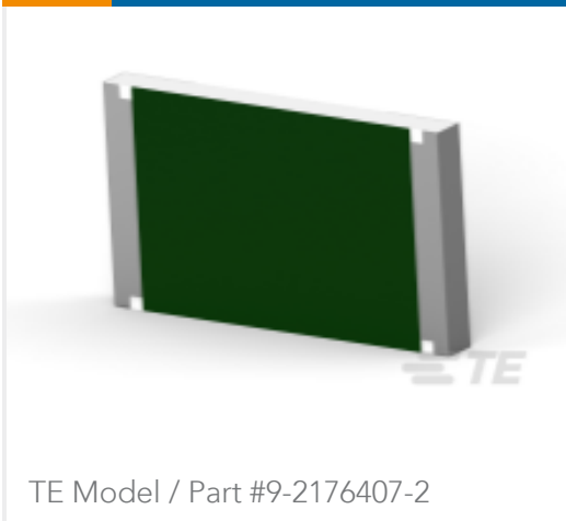
3560 56R 5%