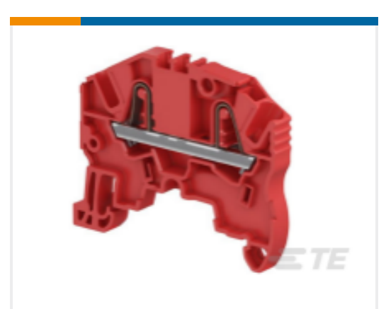
TE Model / Part #1SNK705062R0000 ZK2.5-RD