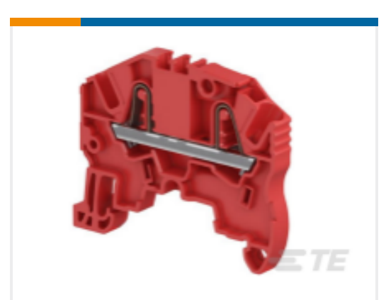
TE Model / Part #1SNK705062R0000 ZK2.5-RD