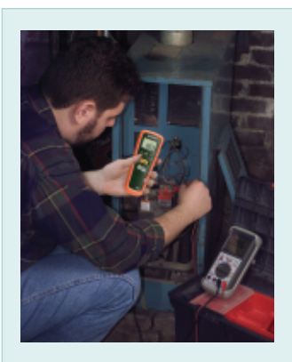
Ideal for performing service checks on furnaces and hot water heaters