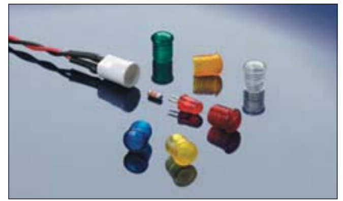
U.S. & Foreign Patents Issued and Pending