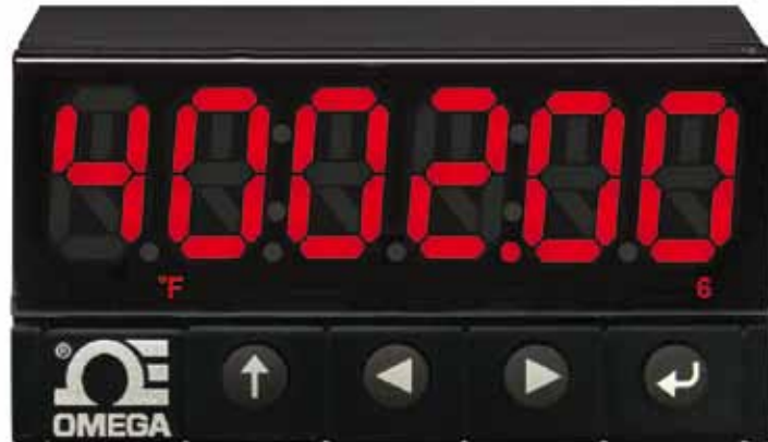
CN8EPT Series shown actual size.