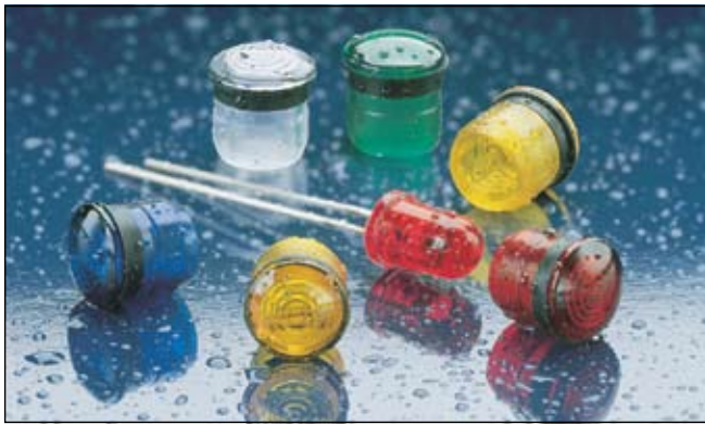
U.S. & Foreign Patents Issued and Pending