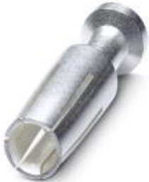
Turned 4.0 crimp contact, individual female contact, core diameter 6.00 mm 2 , silver-plated

Please be informed that the data shown in this PDF Document is generated from our Online Catalog. Please find the complete data in the user's documentation. Our General Terms of Use for Downloads are valid ( http://phoenixcontact.com/download )