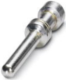
Turned 2.5 crimp contact, individual male contact, core diameter 4.00 mm 2 , silver-plated

Please be informed that the data shown in this PDF Document is generated from our Online Catalog. Please find the complete data in the user's documentation. Our General Terms of Use for Downloads are valid ( http://phoenixcontact.com/download )