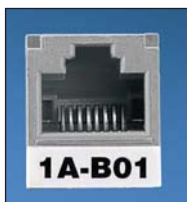
Suggested Label Solutions for TIA/EIA-606-A Compliance