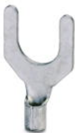
Fork-type cable lug, non-insulated, 2.6 - 6 mm 2 , M6

Please be informed that the data shown in this PDF Document is generated from our Online Catalog. Please find the complete data in the user's documentation. Our General Terms of Use for Downloads are valid ( http://phoenixcontact.com/download )