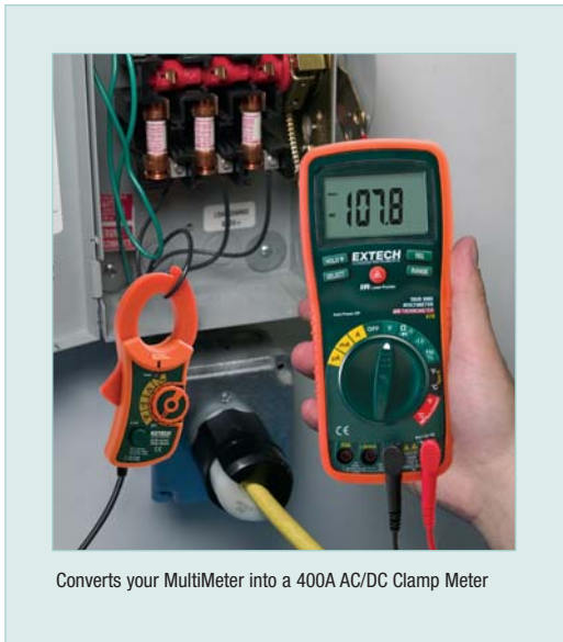
Converts your MultiMeter into a 400A AC/DC Clamp Meter