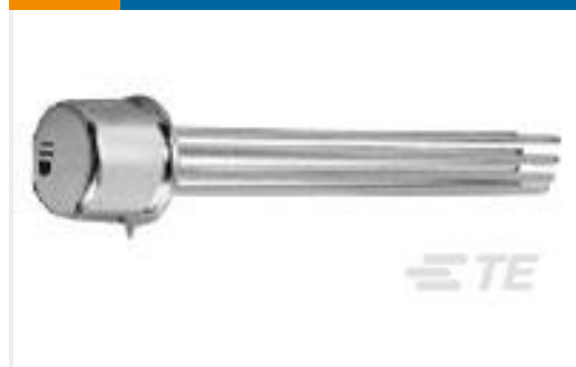
TE Part #1617119-5 J1MAW-18XP = M39016/7-021P