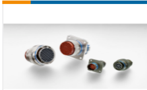
TE Part #YAFD56-14-15SWC019 PLUG ASSY