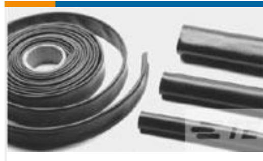
TE Part #CX1369-000 BSTS-13X4FR/NM