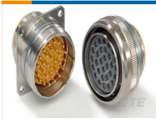
TE Part #ZPF000000000007174 983-ORS 08-98 PN