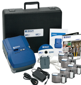
* BMP53 kit shown.