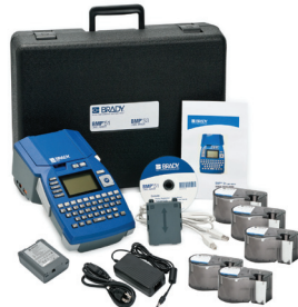
* BMP51 kit shown.