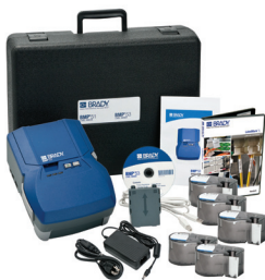
* BMP53 kit shown.