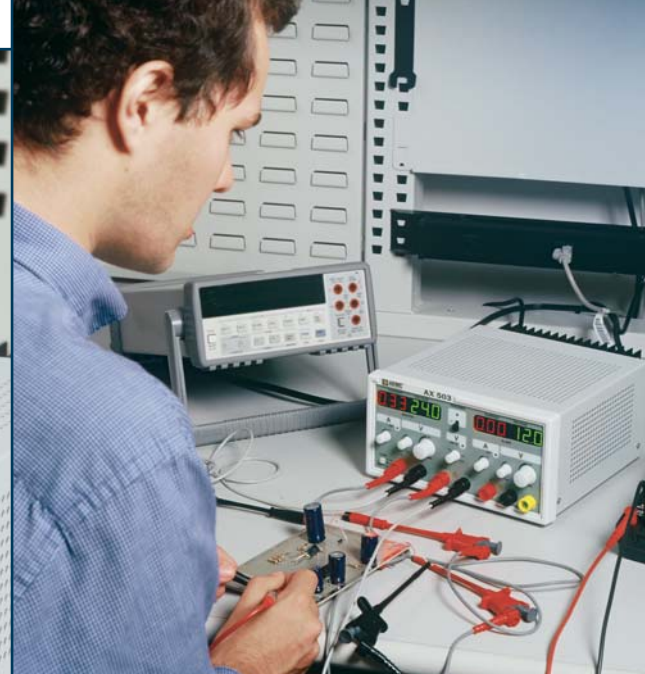
Circuit board design testing using the 30V and 5VDC outputs

Voltage levels and current limits are easily adjustable from the front panel.