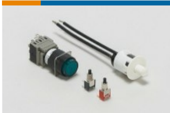
Pushbutton Switches (705)