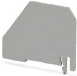
Partition plate, Length: 65.3 mm, Width: 2 mm, Height: 60 mm, Color: gray

Please be informed that the data shown in this PDF Document is generated from our Online Catalog. Please find the complete data in the user's documentation. Our General Terms of Use for Downloads are valid ( http://phoenixcontact.com/download )