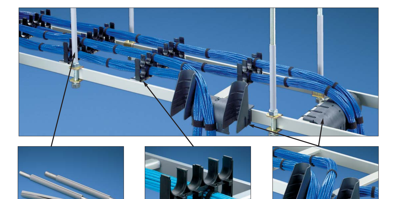
Threaded Rod Covers (TRC18FR-X8)