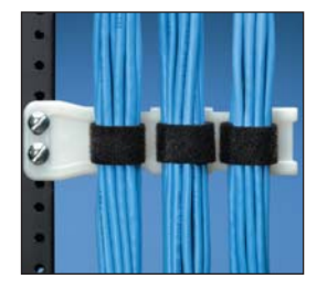
Flat Pan-Post™ Standoffs (PPF2SV-S25-V)