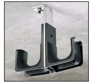
Ceiling Mount Bracket