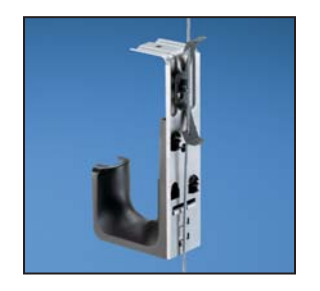
Drop Wire Bracket