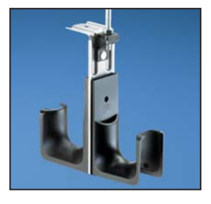
Threaded Rod Bracket