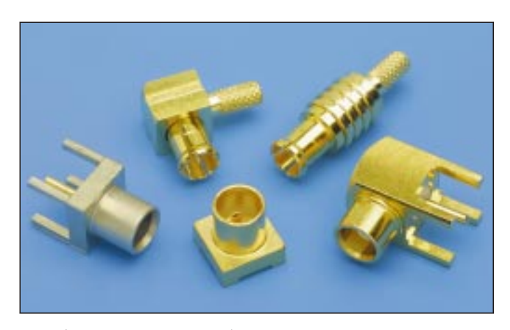
75 ohm MCX Coaxial Connectors

here is a growing demand for a 75 ohm connector that offers an excellent blend of reduced size, weight, and durability in the telecommunications and networking marketplace. Our new line of 75 ohm MCX snap-on connectors meet this need and offers performance up to 6 GHz with low reflection.